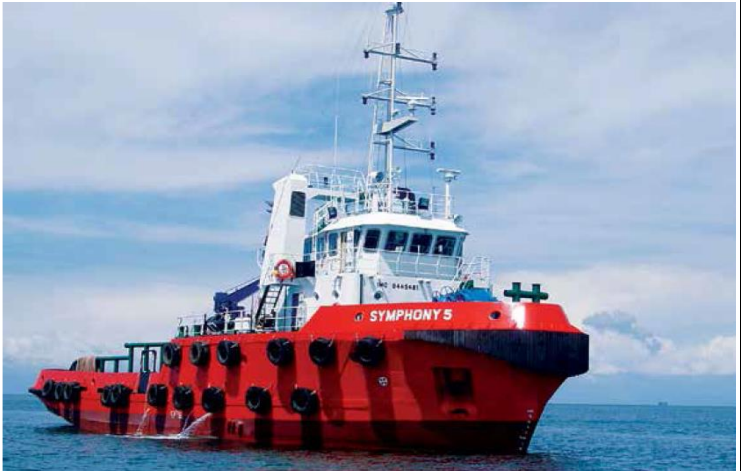
MV SYMPHONY 5 _ AHTS/3600BHP/48.5T BP